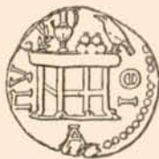
PLATE II.—COIN OF DELPHI.