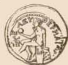
PLATE III. — COIN OF EL- EUTHERNA IN CRETE.