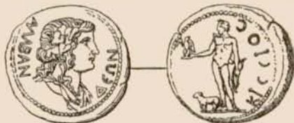
PLATE I.—COIN OF ALABANDA IN CARIA.

In the same way Apollo appears on the coins of Alabanda