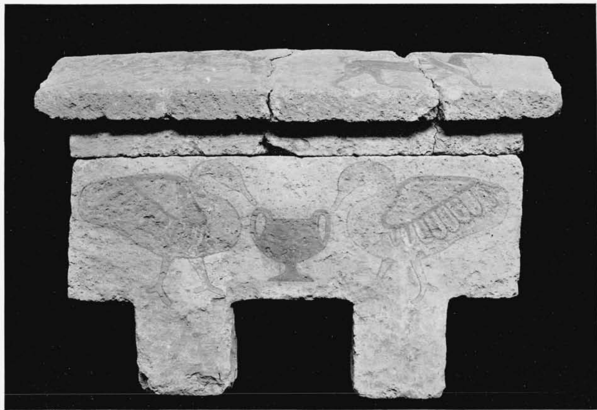
ETRUSCAN SARCOPHAGUS A.