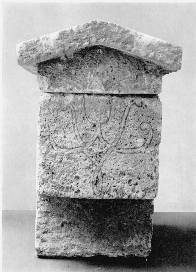
END OF SARCOPHAGUS A.