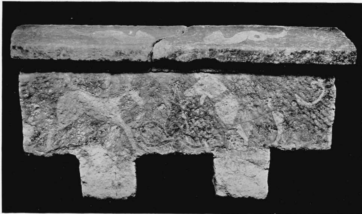
ETRUSCAN SARCOPHAGUS B (SIDE OPPOSITE THE ONE IN PRECEDING PLATE).