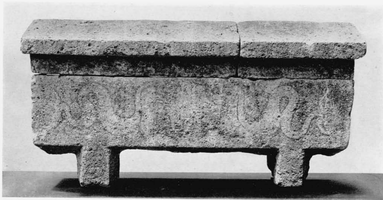
ETRUSCAN SARCOPHAGUS C (SIDE OPPOSITE THE ONE IN PRECEDING PLATE).