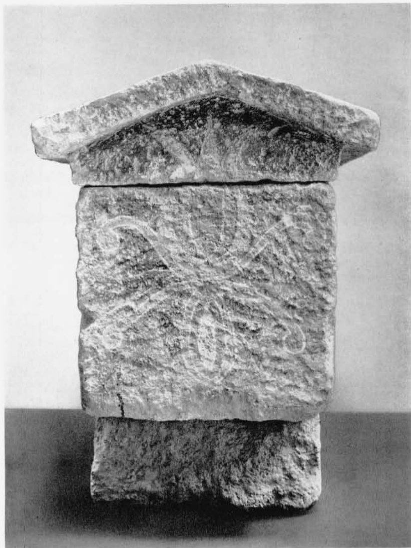
END OF SARCOPHAGUS B (OPPOSITE THE ONE IN PRECEDING PLATE).