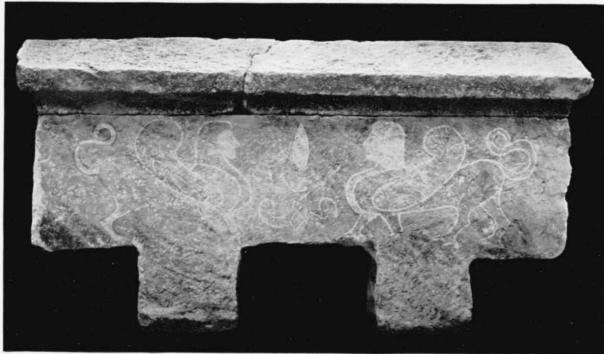
ETRUSCAN SARCOPHAGUS B.