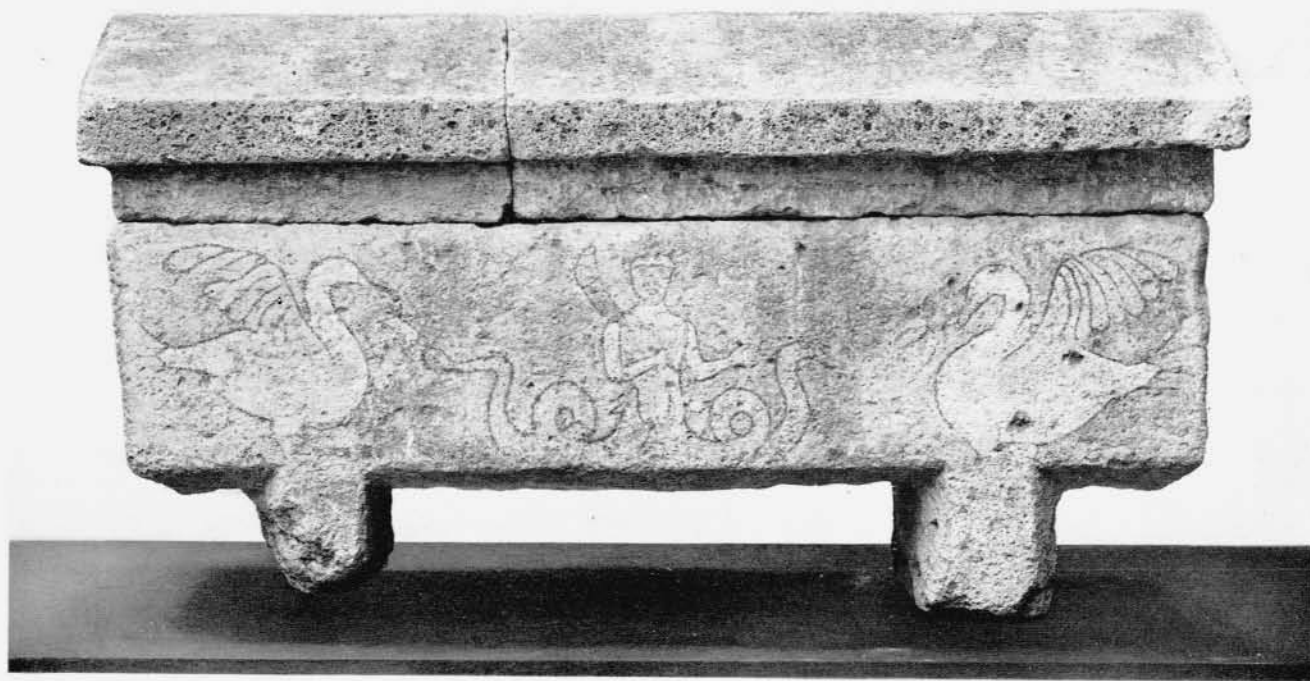
ETRUSCAN SARCOPHAGUS C.