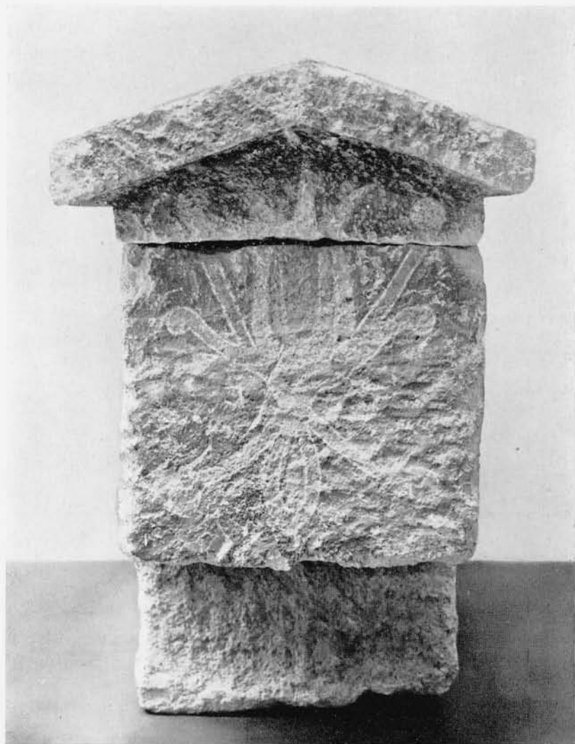
END OF SARCOPHAGUS B.