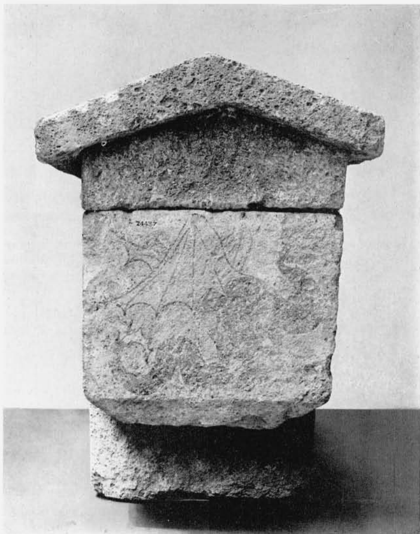
END OF ETRUSCAN SARCOPHAGUS C.