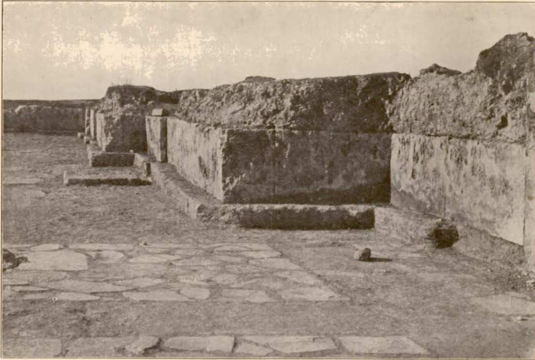
View of Part of West Wall of Palace, Knossos, from West Porch.