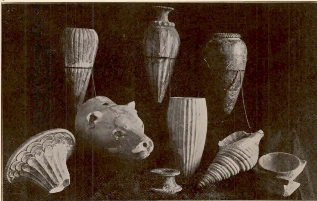
RITUAL VESSELS FROM STONE VASE ROOM ADJOINING SANCTUARY.

* Report of the Excavations of the Palace of Knossos (1903), p. 95 sqq.